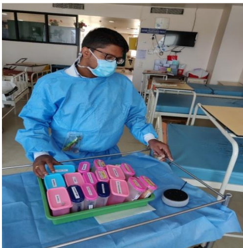
Figure 3: Role of Alexa™ in nursing care.