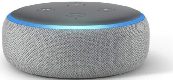
Figure 1: ALEXA™

the associated conditions of the patient. Alexa™ can remind about vaccination days, remind about medical appointments, drugs to be taken, follow up visits (Figure 2). Alexa™ can schedule meeting with family physicians, get prescription for monthly medications, make arrangements for medicines to be delivered door step. This is very important in old patients who suffer from various co –morbidity as well from Alzheimer’s or from poor memory.