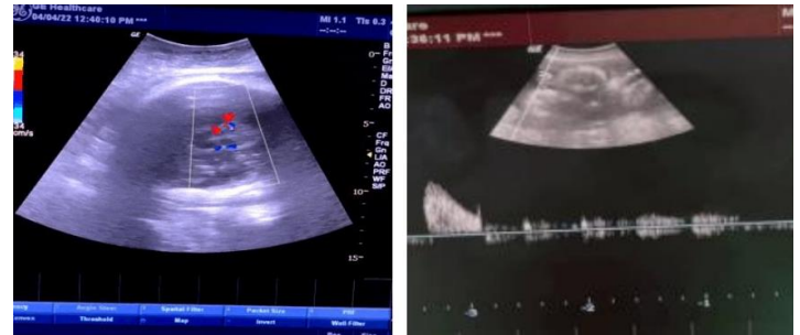
Figure 3: Hemodynamic disorders of the fetoplacental complex (UA, PA) on Doppler analysis.

than 2 cm. In the main groups, placental calcifications were observed in 32 pregnant women (35.6%). At the same time, the level of placental maturation was corresponding in all pregnant women with FGRS of the first degree, in pregnant women with FGRS of the third degree-in half of all cases, it's premature "aging" was noted, and in pregnant women with FGRS of the second degree - 14 (33.4%) did not meet the deadline, and in 11 (78.6%) there were cases of premature "aging" and in 3 (21.4%) cases - morph functional insufficiency. In most cases, a combination of several exographic features was observed. In the individual analysis, changes in placental thickness, placental cysts, premature maturation and "aging" were observed in 10 cases (71.4%) in a small group with grade III FGRS. as well as a combination of exographic signs such as calcification. Of 42 women with grade II FGRS, 36 pregnant women (85.7%) were characterized by a combination of symptoms such as premature maturation and "aging", calcification, low and placental density. However, the most important echographic marker of grade II-III FGRS was placental thickness. Thus, placental hypoplasia was 1.4 times more common in patients with severe FGRS than in subgroups I and II.