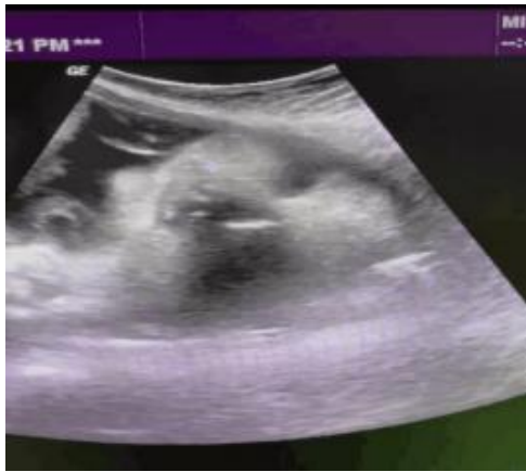
Figure 1: Pregnant N. (birth history No. 1890). Diagnosis: Pregnancy II 33.4 weeks. FGRSII II degree. Circulatory blood circulation disorders of the fetoplacental system are 2b degrees. The buccal coefficient is 8 mm.

control group, more than 87% were detected in 2 (6.7%) cases and less than 71% in 1 (3.3%) case, which can be explained by the constitutional specifics of the skull configuration in fetuses. The main groups showed an increase in the number of ultrasound markers with an increase in the severity of FGRS, as well as an increase in the number of pregnant women with different ultrasound markers. This is largely due to the fact that the buccal index is less than 10 mm (in pregnant women with grade I FGRS - 8 (23.5%), grade II - 30 (71.4%), and in the group with grade III FGRS - 100% of pregnant women). A decrease in the buccal index is associated with immaturity of subcutaneous fat in fetuses with FGRS, and placental hypoplasia is associated with placental insufficiency. Ultrasound specificity of the placenta in the analyzed small groups is shown in (Figures 1-3).