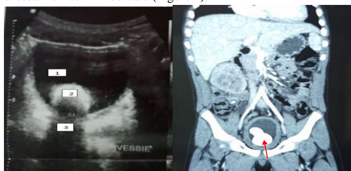
Figure 1: Ultrasound axial and sagittal section showing urosacnner-confirmed nephrolithiasis in a child with cystinuria: 1. Bladder, 2. Scan-confirmed lithiasis (red arrow), 3. Posterior shadow cone.

At the end of the survey, 64 cases of CTIN were recorded in 709 children with chronic kidney disease. The hospital prevalence was 9% (64/709), which corresponds to an average of 08 cases per year in the department. The average age of children at onset of symptoms was 5.5 \pm 5.3 years with a median age of 4 years and extremes of 0 and 15 years. The average age at admission to paediatric nephrology was 6.4 \pm 4.4 years with a median of 5 years, corresponding to an average diagnostic pathway of 1 year? The gender ratio (M/F) was 2.4 (45/19). 73.4% (47/64) of the children were coming from Dakar region. Consanguinity was found in 11% (7/64) of cases. The reasons for consultation as well as biological blood and urine findings are listed (Tables 1,2). Bacteriological examination of urine was positive in 11% (7/64) of cases and detected Escherichia coli in 42.8% (3/7) of cases. Ultrasound examination revealed nephrocalcinosis was present in 28.1% (18/64) of cases, urinary tract malformation in 17.2% (11/64) of cases, and an obstructive intra-bladder stone in an urosacnner- confirmed case (Figure 1).