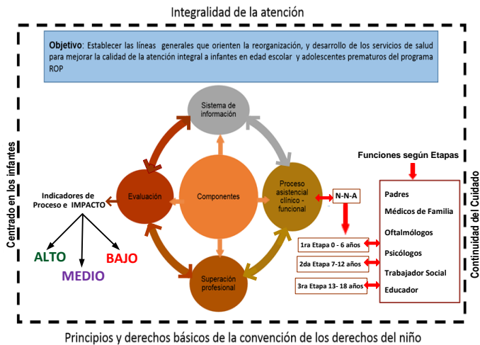
Figure 2: Comprehensive Health Care Model for pediatric patients screened in the Retinopathy of Prematurity Program.

In Cuba, there is a comprehensive strategy for the treatment of patients with chronic non-communicable diseases, encompassing both health promotion and disease prevention. The systematization of experiences in the clinical ophthalmology service, the knowledge of the current health situation of the country, its social, political and economic reality; the structural and functional characteristics of the health system in Cuba, together with the legal, bioethical, political and strategic provisions in health matters, are the basic supports to model the